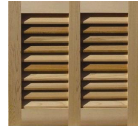
No Center Rail - Short

Prices/specs subject to change without notice. Nominal shipping charges apply.