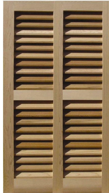
Shown With 2 1/4" Beveled Louvers Substile and Center Cross Rail

Increase frame thickness from 1 3/8" to 1 1/2" - Add $85 per shutter