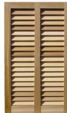
2 1/2" Louvers - No C-Rail