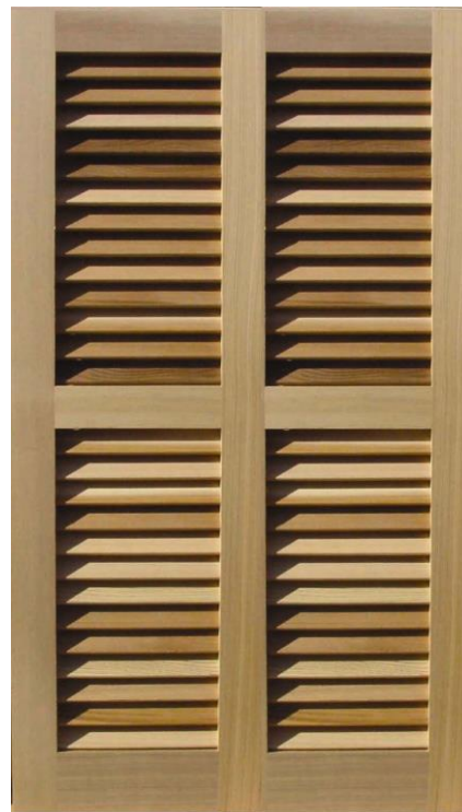
Shown With 1 7/8" Louvers Substile and Center Cross Rail

Prices/specs subject to change without notice. Nominal shipping charges apply.