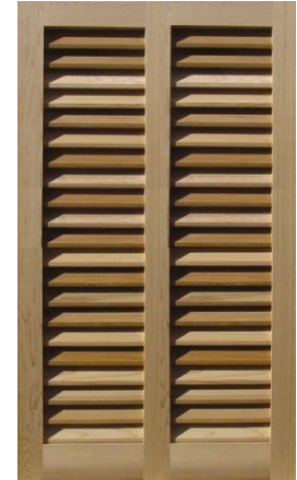
No Center Rail - Tall