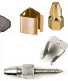
Bullet Catch Hidden Holdback Solid Brass Frame or Brick $20 Per Pair Stainless $28 Pair