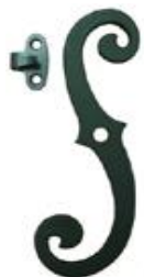
Traditional "S" Hold Aluminum 7" Tall $30 Per Pair