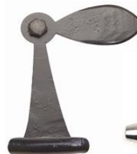
BW O-Belmont Hand Forged Steel 5" Tall E-Coat Finish $64 Per Pair