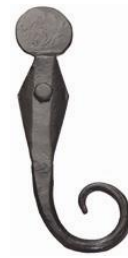
BW Offset Rat Hand Forged Steel 6 1/2" Tall E-Coat Finish $64 Per Pair