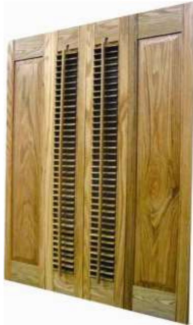
Traditional Louvers & Panels in 3/4" Thick Hardwoods Traditional shutters can be made with matching frame profiles when using both louver and panel shutter types in one window. Stained red oak shown above.