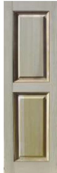
INT-DE-RP Decorative Inset Molding