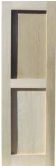
INT-DE-FP Flat Panel