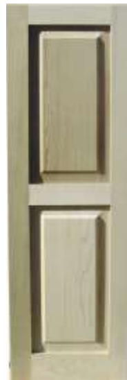
INT-DE-RP Raised Panel

These hefty interior raised panels are used as doors on pantries, closets, cabinets, shelving, and more. Flush sanded mortise & tenon construction allows for inset or surface trim options. Available in raised or flat panel styles. Add 10% for stain grade basswood. Call for quote using red oak or mahogany.