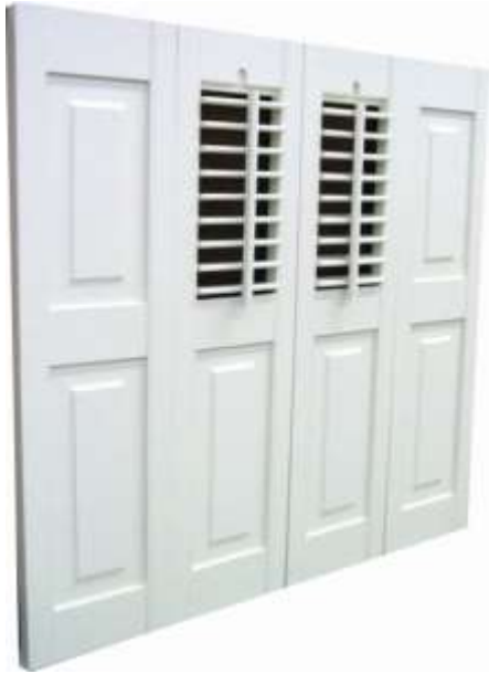
Brooklyn Style Combo Louvers & Panels Brownstones often have deep window pockets that include combination louver and panel shutters, with the outer panels folding into a "wall pocket" on each side of the window. Combination shutters are made in 1 1/8" thickness with choice of 1 7/8" 2 1/2" or 3 1/2" louvers. Often require special measuring process