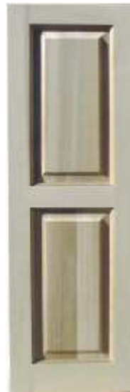
INT-DE-RP 1/4 Round Inset Molding