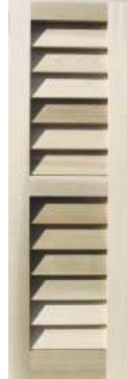
INT-DE-FL Traditional 3 1/2" Louvers