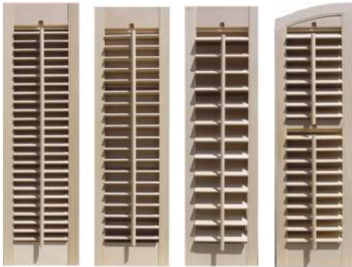
MLIP 1 7/8" Louvers MLIP 2 1/2" Louvers MLIP 3 1/2" Louvers MLIP Small Curve (shown w/cross rail)