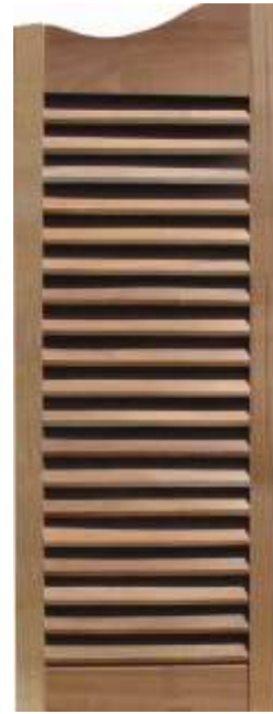
Interior Door Sizes 1 3/8" Thick Basswood, Red Oak, Mahogany Panel/louver combos make excellent doors with ventilation for shelves pantries, cabinets, & more. Café curve shown above creates a saloon door.