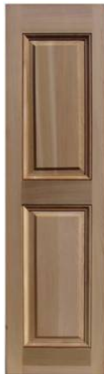
RPHD SPEC Decorative Inset Molding On Raised Side

ALL INBETWEEN SIZES AVAILABLE - CALL FOR PRICE ON LARGER SIZES