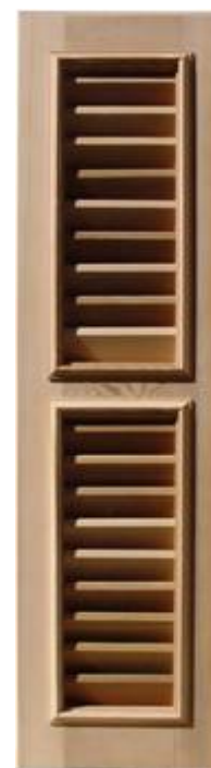
CMTX Shown With Surface Molding Add $60 Per Pair