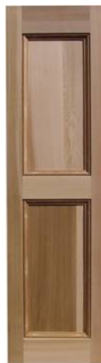
RPHD SPEC Decorative Inset Molding On Flat Side