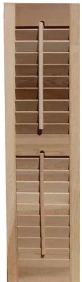
MLE 2 1/2