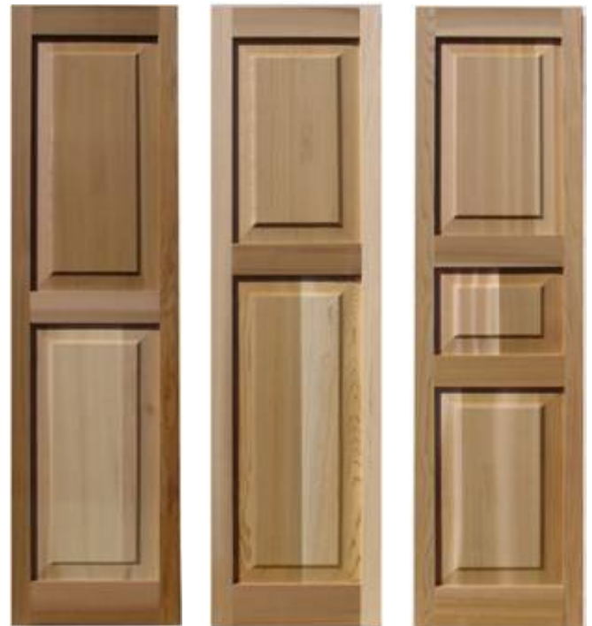
RPS REG RPS COTT RPS WMS Regular Cottage Williamsburg 50% Over 50% 40% Over 60% (Add $50 per pair)

Shuttercraft, Inc. 15 Orchard Park Rd. Madison, CT 06443