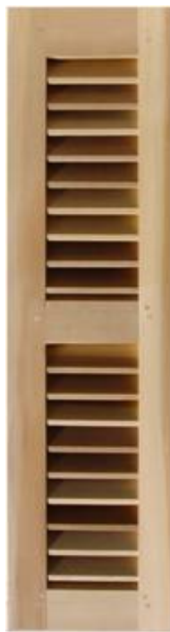
CMTX Shown With Louvers Down

ALL INBETWEEN SIZES AVAILABLE - CALL FOR PRICE ON LARGER SIZES