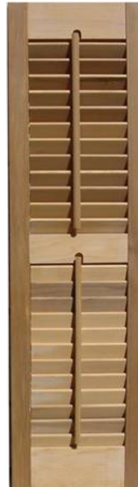
MLE 1 7/8

Yoke pins on louvers and tilt rods are dip galvanized to assure long life. Joints are reinforced with dowels and long, concealed stainless steel wood screws. These authentic wood shutters are appropriate for restoring vintage homes, public buildings or dressing up newly constructed houses. They may be installed with functional hinges and holds or permanently fastened to achieve a touch of elegance.