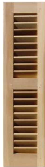
CMTX Shown With Louvers Up