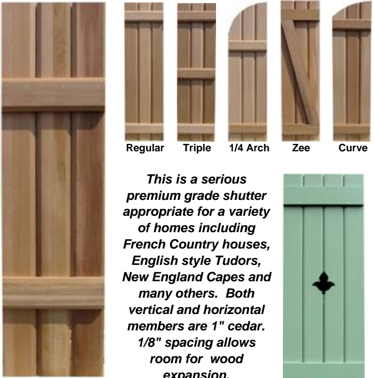
Regular Triple 1/4 Arch Zee Curve

Shutter widths made on the whole inch - All Heights Available