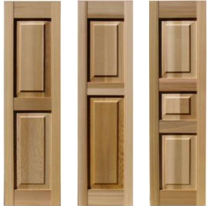
RPHD REG RPHD COTT RPHD WMS Regular Cottage Williamsburg 50% Over 50% 40% Over 60% (Add $50 per pair)

ALL INBETWEEN SIZES AVAILABLE - CALL FOR PRICE ON LARGER SIZES 50% Over 50% 40% Over 60% (Add $50 per pair)