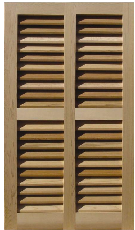
Shown With 2 1/4" Beveled Louvers Substile and Center Cross Rail

Cross rail location can be specified at NO CHARGE Increase frame thickness from 1 3/8" to 1 1/2" - Add $100 per shutter Call for pricing on larger sizes