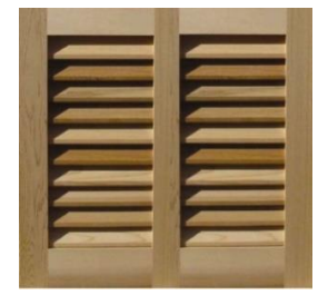
No Center Rail - Short