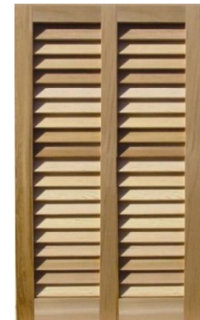
2 1/2" Louvers Shown with no center rail