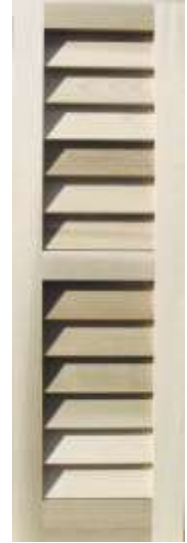
INT-DE-FL Traditional 3 1/2" Louvers