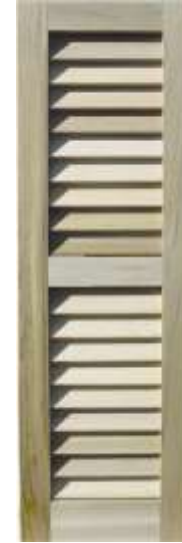
INT-DE-FL Traditional 2 1/2" Louvers